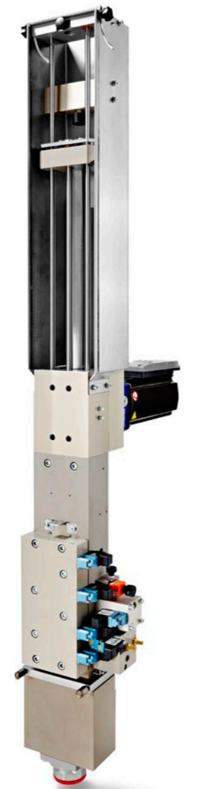
Integrated Blowing Station