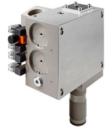
Blowing Unit CompactBlow