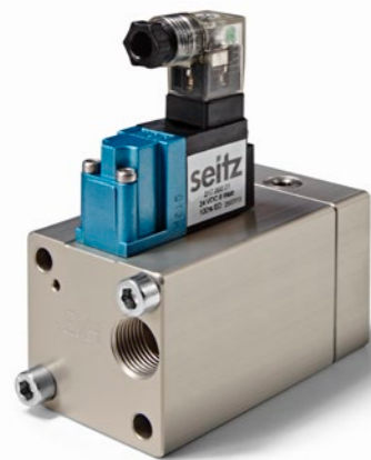
Compensation Valve Compensa IV

Optimal energy efficiency, high output and long maintenance intervals of the Blowing Station keep the TCO value of your machine as low as possible.