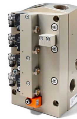
Blowing Block BigBottle TFM